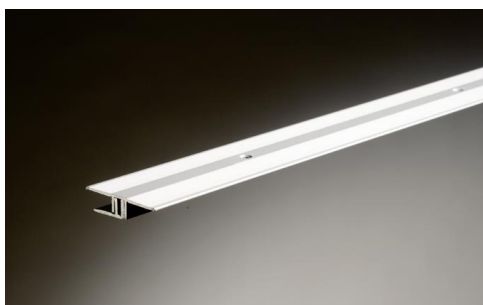
T-moulding: From laminate to laminate